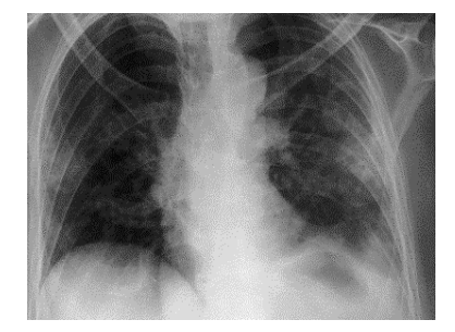
Fig. 2 – Chest X-ray on discharge from the hospital showing radiological regression of the previous described changes (in Figure 1).

The patient felt well in the following period. She was monitored by a thoracic surgeon, who described a normal CXR. Four months later, when the epidemiological situation allowed, a chest CT scan was performed, which described ground-glass opacity bilaterally in the lower lobes with elements of interstitial fibrosis and thickening of the parietal pleura in the left upper lobe (Figure 3).